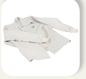
LEATHER JACKET LARGE Product number: 510438