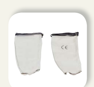
Product number: 184184