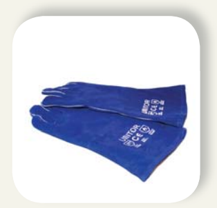
WELDERS GLOVES, 6 PAIRS Product number: 632786