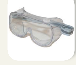
SAFETY GRINDING GOGGLES