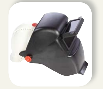
SAFETY HELM W/FACE SH. Product number: 619114