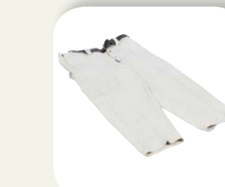
LEATHER TROUSERS W/BELT Product number: 633016