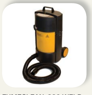
FUME EXTRACTOR Product number: 735878