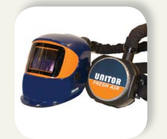
AUTOVISION PLUS FRESH AIR WELDSHIELD Product number: 767000

onboard should include, without being limited to, the points below to ensure safe operation.