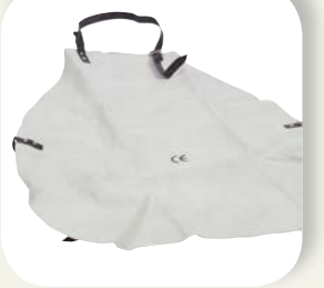
LEATHER APRON F/ WELDING Product number: 510420