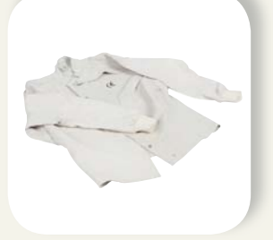
LEATHER JACKET X-LARGE Product number: 510446