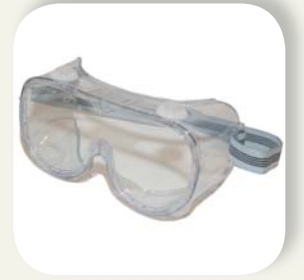
Product number: 653410