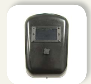
FACE SHIELD W/HANDLE Product number: 619098