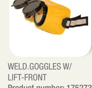
Product number: 175273