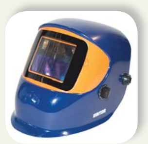
AUTOVISION PLUS WELDING SHIELD Product number: 767001