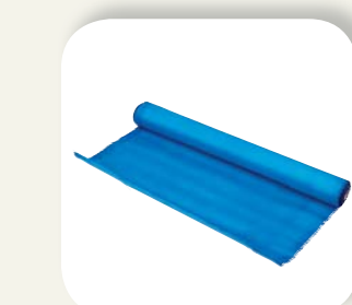
WELDING SPATTER BLANKET 1 X 10M Product number: 646067