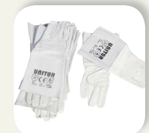
TIG GLOVES, 6 PAIRS