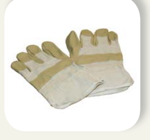
WORKING GLOVES, 12 PAIRS Product number: 633057