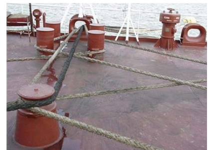
Picture 1 shows a particularly bad mooring procedure. Each rope should have its own route and not be in contact with other mooring ropes.

Natural elements like weather, wind, swell and tide can affect your rope's lifespan.