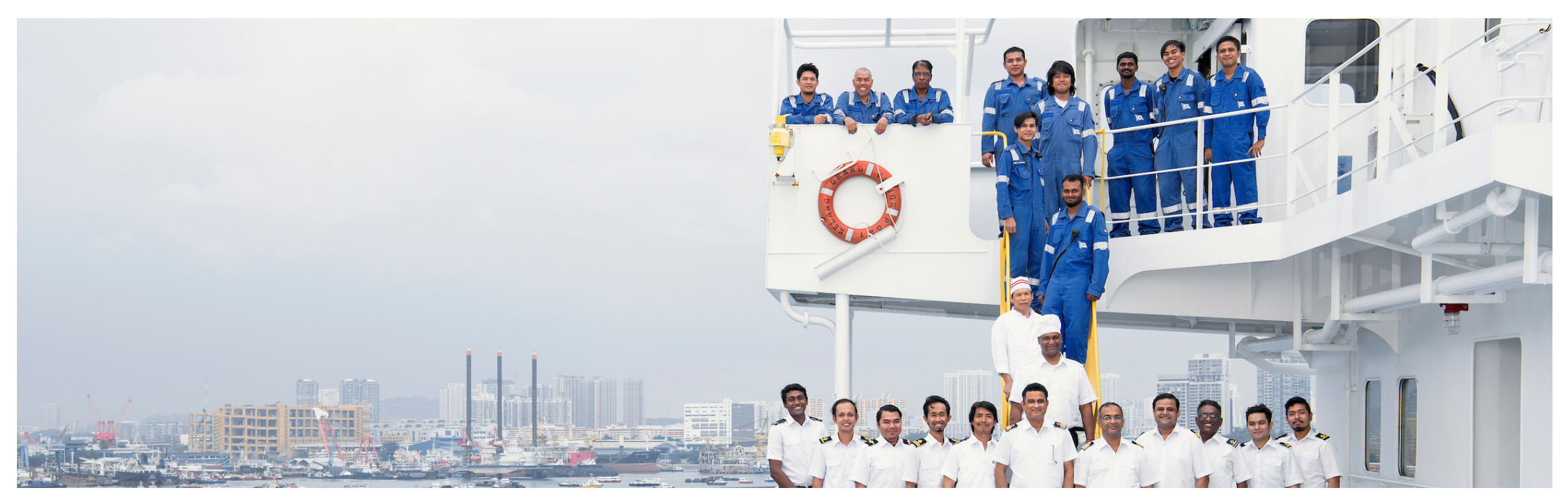
Maintaining a clean and hygienic working environment for seafarers requires the right products and team effort - everyone has a part to play.

"Prevention is better than cure and pandemics are no different. The international shipping industry can chart a path in this new normal by following cleanliness and hygiene procedures - therefore ensuring that the crew on board can continue to live and work in a safe and healthy environment," Tan says.