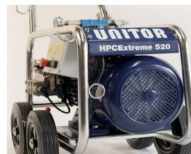
HPCE 520 INOX Product No. 721520