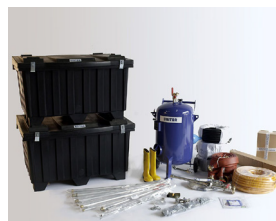
Panamax Cargo Hold Cleaning Kit Product No. 778855