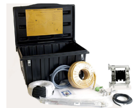
Cargo Hold Compact Kit Product No. 778955