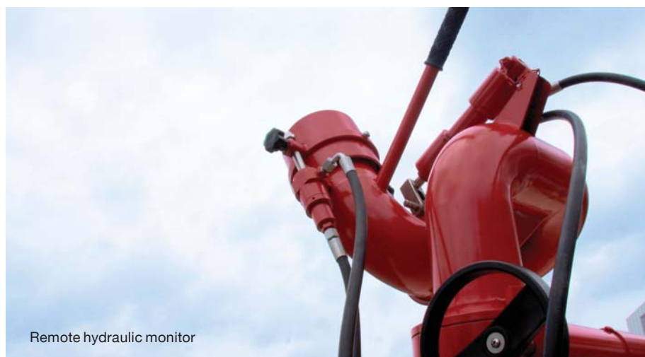
Remote hydraulic monitor