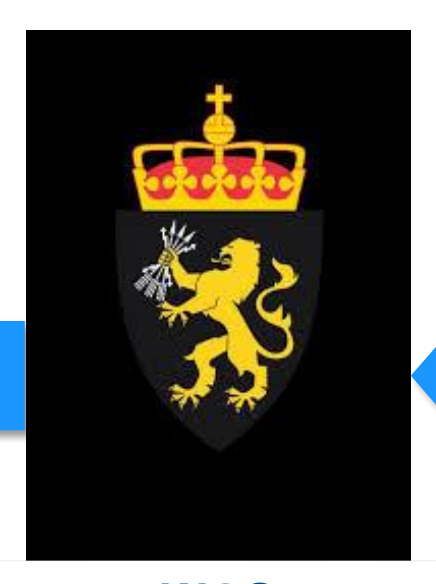
WGS Coordination Cell