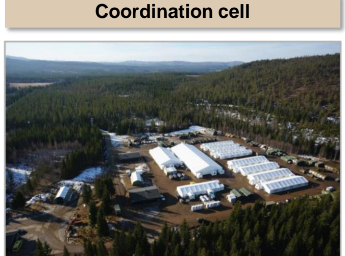
Host Nation Support (HNS)