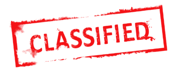
Other areas in development